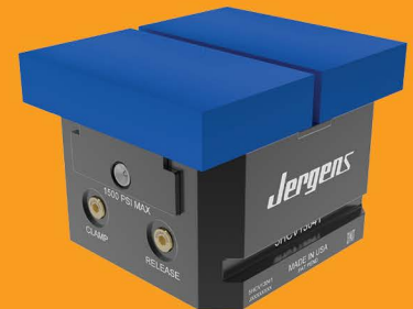
130mm 5-Axis Hydraulic Self-Centering Vise