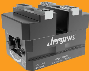
75mm 5-Axis Self-Centering Vise

Quick-change jaws incorporate a pull down feature to actively minimize jaw lift!