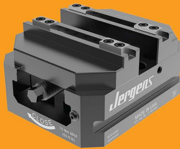
130mm 5-Axis Self-Centering Vise